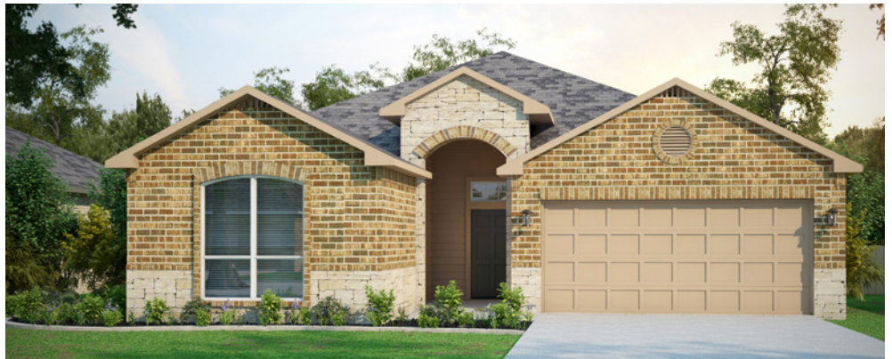
the Rivington 300