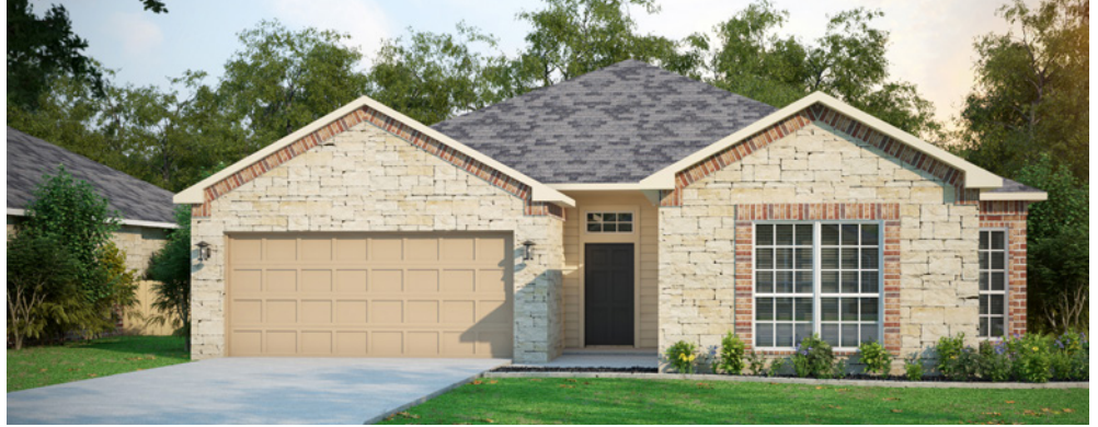
the Rivington 100

Elevation designs available for the Rivington: