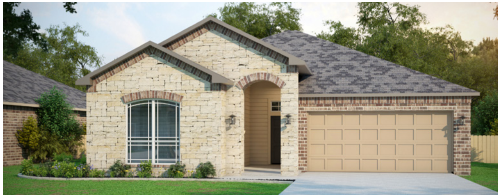
the Rivington 200