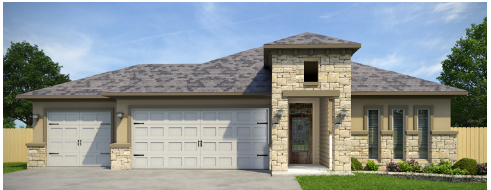
the Holly 550