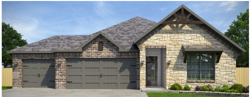
the Holly 450