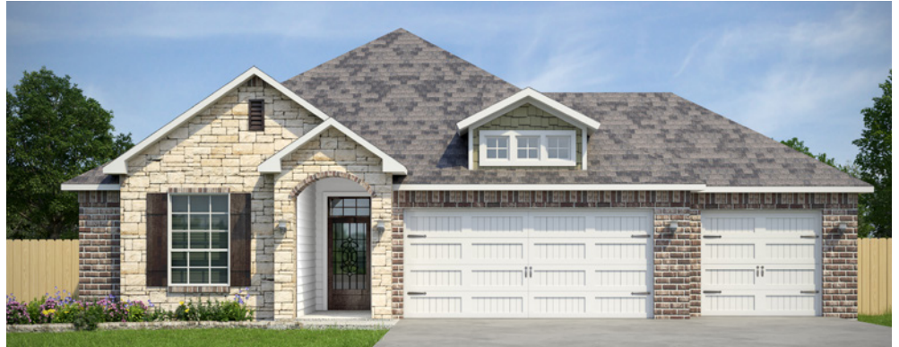
the Holly 150

Elevation designs available for the Holly: